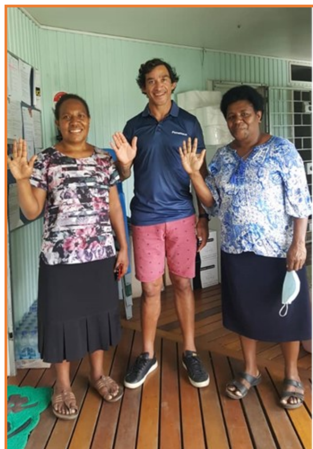
Femili PNG Lae Case Management Centre was privileged to have the former rugby league legend and Fone Haus Brand Ambassador, Jonathan Thurston visiting the office on 18 January 2023.

Inserted photo: Mothers putting up an item presentation during the celebration.