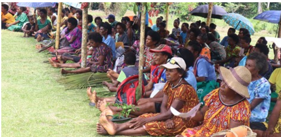
Mothers celebrating at Hojavahambo village along the Kokoda Highway.

KTF and Femili PNG under the Kokoda Track Foundation Project Zero sponsored these events in partnership with Oro Community Development, Biru Correctional Service and JSTI. Femili PNG acknowledges KTF for the support to organize such events.