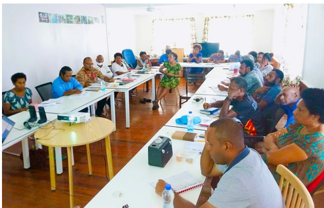
Participants listening and interacting during the training session

Femili PNG facilitators were happy hearing these reflections from the participants. They are looking forward for the trained participants to utilised learned knowledge and skills in addressing FSV effectively while at work performing their duties.