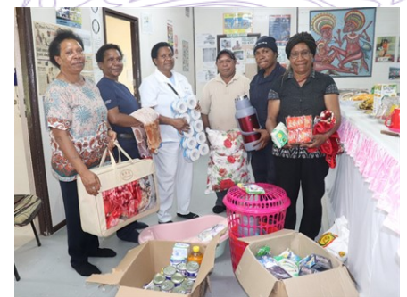
Femili PNG reaching out to Simbu ...pg 6