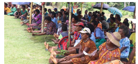
Oro partners celebrates...page 7