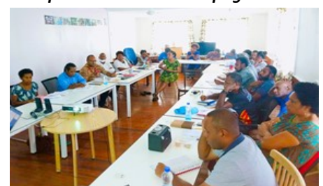
Burnet Institute receives...page 11