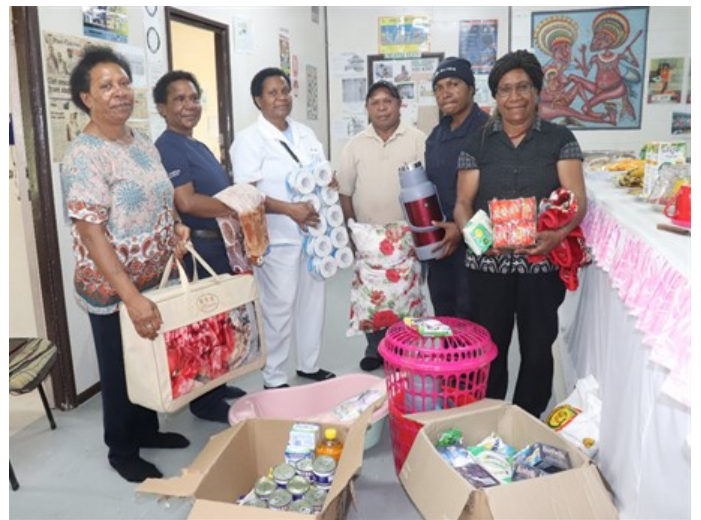
Simbu FSC and FSVU female officers received donations from Femili PNG. 13.04.2023

outcomes for survivors. During the ceremony for the hand-over of donated goods, the Kundiawa FSC and FSVU teams became emotional when speaking of their collaboration to assist survivors in the province despite daily challenges and limitations.