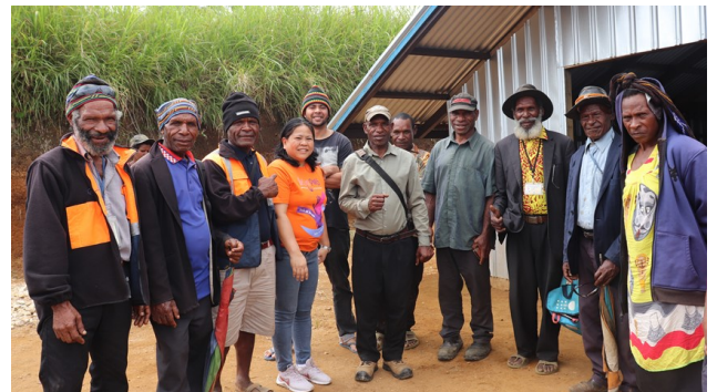
Few training participants FPNG team met with at Kagua-Erave.

Femili PNG team were pleased to learn that the training participants have since been rolling out awareness-raising sessions for their families, and are building a shelter for children and widows. The team thanked and congratulated KSHA Program Manager as well as the training participants and encouraged them to continue to do what they are doing for the good of their communities.