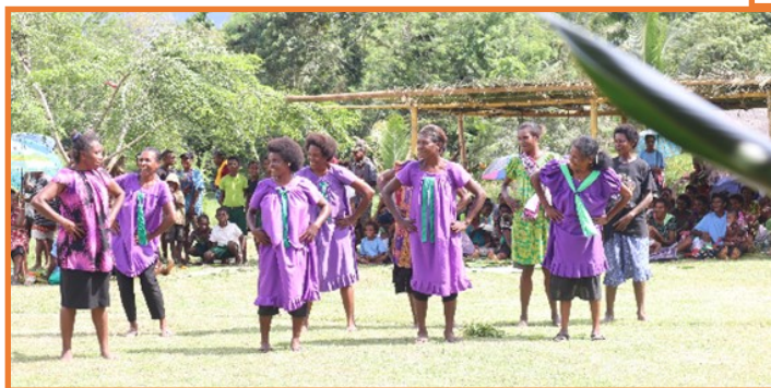
Kokoda Track Foundation and Femili PNG supported mothers in Hoyavahambo village along Kokoda highway to observe and celebrate IWD . 08.03.2023

Inserted photo: Mothers putting up an item presentation during the celebration.