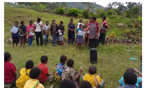
Awareness at Watabung Primary School in Daulo District, EHP on 6 May 2021.