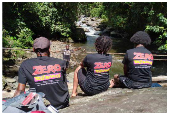
Outreach and KTF team taking a break after crossing Iora river on their way to Abuari village along the Kokoda track.