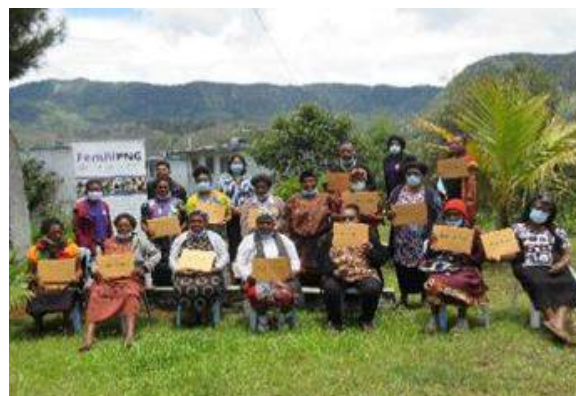
Through the Spotlight Initiative, Femili PNG facilitated a week training on FSV and Trauma Informed Care training to the Kirapim Southern Highlands Association (KSHA) and its partners in Mendi, Southern Highlands Province from the 15-19 March 2021.