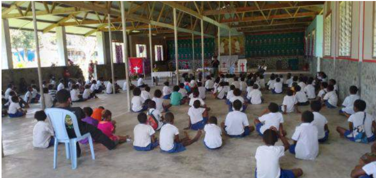
Awareness session at Gorari Elementary School on 31 May 2021 in Sohe District, Oro province.