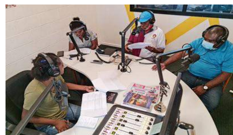
Outreach sets awareness on radio ...pg 3