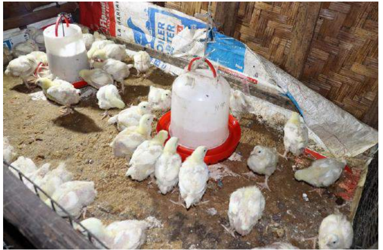
Poultry donation to St. Francis Care Home by Femili PNG