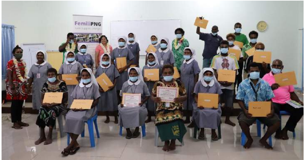
Participants after receiving their certificate of participation after the training.

Like many other places in Papua New Guinea where FSV and child abuse is a pressing issue that affects many families in the communities, Kokopo is no exception. Survivors are further victimized when they do not know where or how to get help. A few of