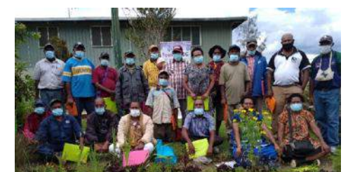
Participants from Yagaria LLG after the 2-day FSV info session at Lufa District