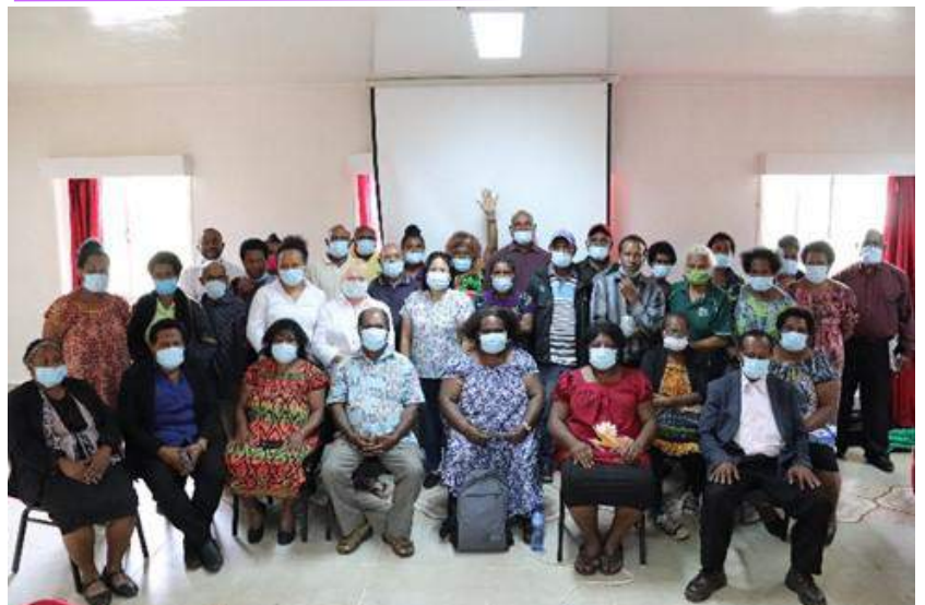
With support from the Spotlight Initiative, EHP FSVAC resumes meeting with stakeholders in Goroka on 3 February 2021.