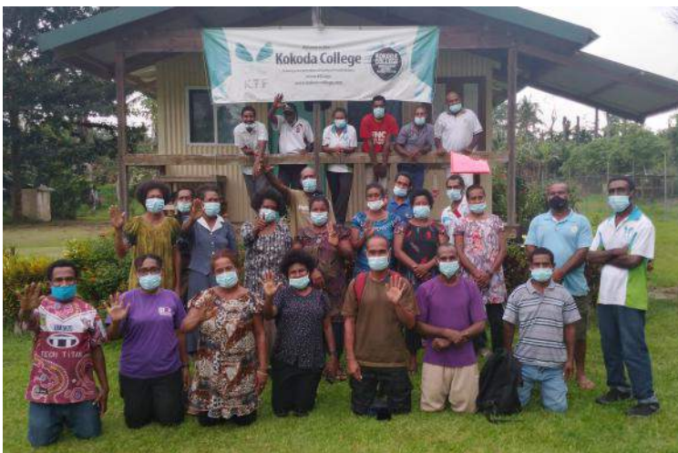
Child Protection information session participants with KTF and Femili PNG team after the two-days session from 3-4 June 2021 at the Kokoda College.