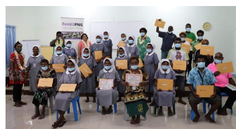
Training for Coupe Meri safe house ...pg 10