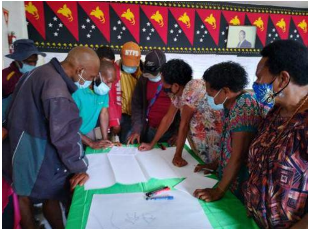
Participants from Yagaria LLG in Lufa District having a group discussion during an information session from 26-27 May 2021 in Eastern Highlands province.

From 26 th -29 th April, Femili PNG Outreach team conducted two sets of 2-day FSV information sessions to participants from the two LLGs in Lufa District, Yagaria and Mount Michael LLGs. Unfortunately, the outreach team could not reach Unavi LLG due to logistics and communication challenges. However, Femili PNG continues to work with Lufa District and the Community Development Office to reach other LLGs. A total of 58 representatives participated in these sessions, and members to create the community committee for Lufa District