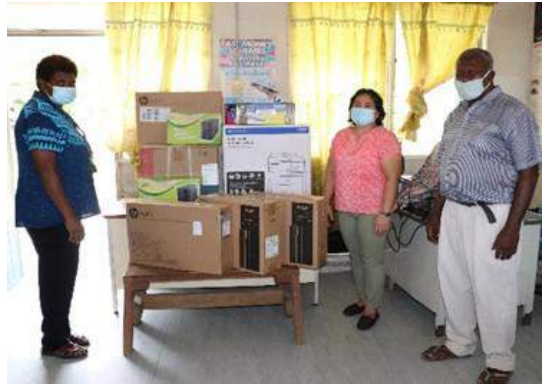
Kokopo SOS received donation of IT equipment including ink and air condition from Femili PNG on 29 January 2021.