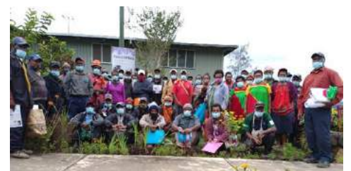
Participants from Mt. Michael LLG after