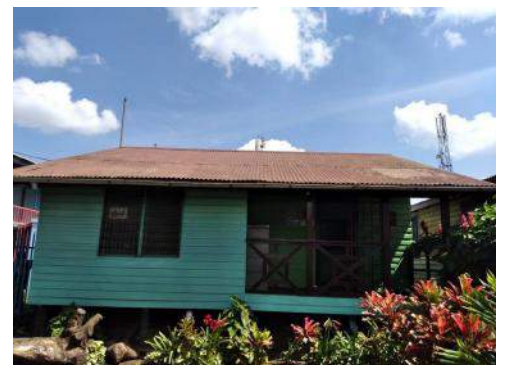
Femili PNG's outpost in Goroka at the Community Development Office

the funding support from the EU-UN Spotlight Initiative and the Australian NGO Cooperation Program (ANCP). “The Spotlight Initiative and UN Women support has allowed us to establish this outpost, and the ongoing funding from ANCP through Friends of Femili PNG will allow us to keep it operational into the longer-term. The funds invested by donors will result in real outcomes for women and girls in EHP”.