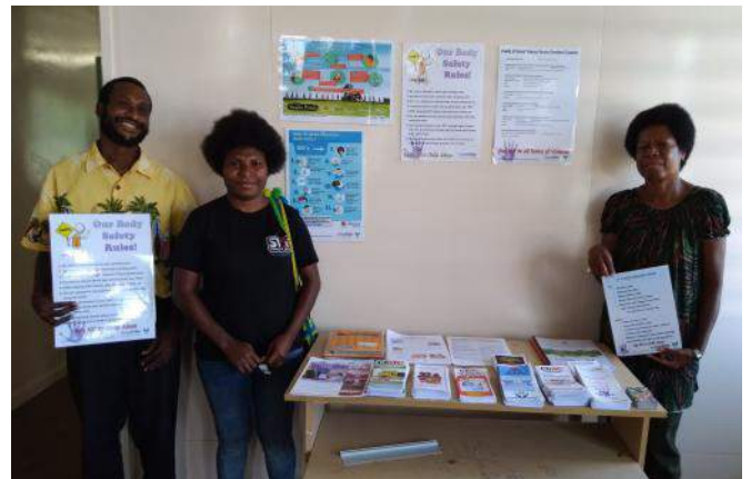
FSV Corner set up at Kokoda Primary School. FPNG Outreach officer with Kokoda Primary school teachers.