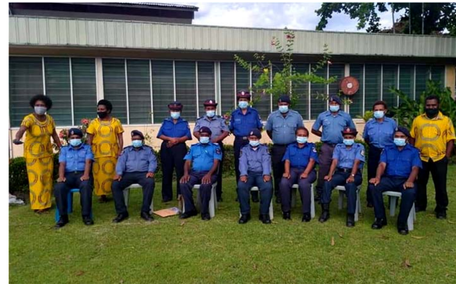
Group photo: FPNG Training team and Morobe PPHQ officers after the training

The participants appreciated the in-depth training and said they will also extend this information learnt to their families and communities.