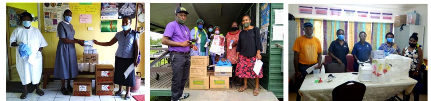
Left-Right: Femili PNG team delivered PPE to health centres which included Centre of Mercy (Photo 1), Wampar Health Centre (Photo 2) and Day Care centre at Angau Hospital which provides medical treatment for HIV and AIDS patients (Photo 3). The PPE included hand sanitisers, face masks and shields, paper towels, and disposable gloves.