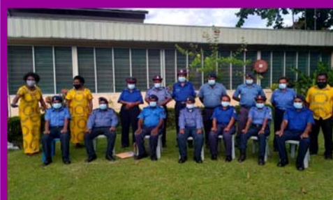
FSV training to PPHQ Officers .....pg 6