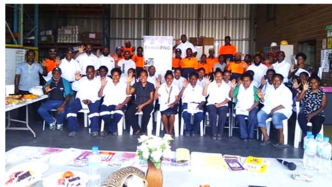
Group photo: FPNG team with NCS staff after awareness.

On 25 November 2020, Femili PNG was invited by the National Catering Services (NCS) in Lae to conduct awareness in celebration of the International Day for the Elimination of Violence Against Women. Femili PNG also participated in the other events during the 20days of Activism; the Universal Children's Days on 20 November and the World Disability Day on 3 December 2020 in Lae.