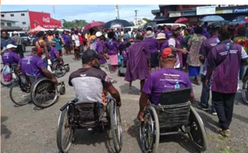
March in Lae during the World Disability Day on 3 December 2020.

For the past six months from July to December 2020, Femili PNG Outreach team conducted 24 awareness sessions at 22 different locations in Morobe Province. The team reached 3,475 men, women and children at business houses, special events, schools, churches, communities and health centres through its awareness activities. The activities included sharing information about family and sexual violence, child abuse, child protection, FSV related laws, and available services.