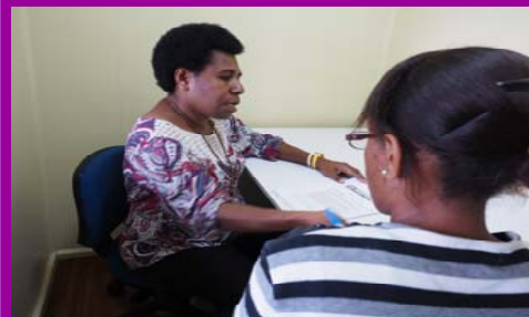
Case Worker's story; Helping a survivor ..pg 4