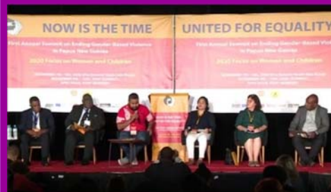
FPNG CEO speaks at GBV summit .....pg 7