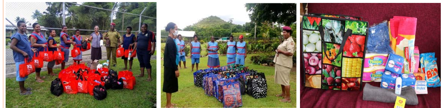
L-R: Photo 1 - In September 2020, hygiene kits and toiletries were donated to female inmates at Buimo Prison, Morobe Province..