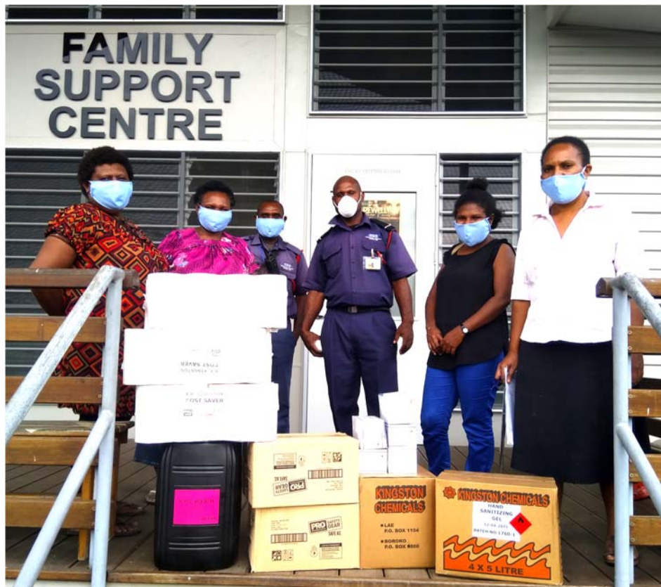
FPNG delivered PPE to Family Support Centre at Angau Hospital in Lae under the UNDP COVID response funding.

times of crisis, such as during a pandemic. Support from partners, donors, and stakeholders is a key reason why Femili PNG's response over 2020 was effective, allowing survivors to be connected with essential services in a time of greater need.