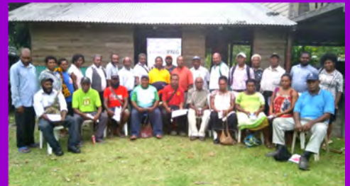
Oil Search staff organise FSV awareness for community leaders...pg 2