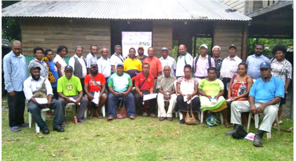
Group photo: Participants of the 1-day awareness session at Gravel, Kamkumung on 16 th January 2020 with Femili PNG Outreach and Training team.

A total of 39 people attended that session; 21 men, 12 women and 6 children. The awareness session was more interactive with