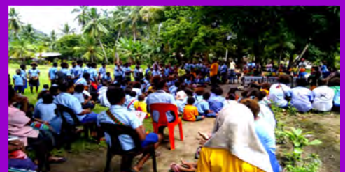
FPNG staff do awareness to Buakap Primary School students in Salamoua...pg 2