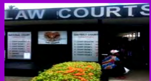
Client success story: Shay's story.....pg 3