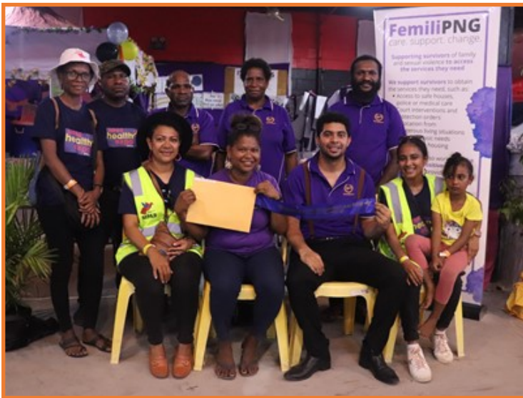
The Femili PNG Lae project staff and staff at Head Office participates at the Morobe Province Agriculture Show under Colgate Health Expo from 19-20 October and retained 1st placing for the second time. The show committee presented certificate and cash prize of K1,500 to FPNG.