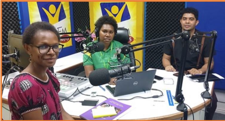
L-R: FPNG Communications Officer, SDA Hope FM Announcer and Deputy OD for FPNG Lae Project after the radio awareness—live talk back show in Lae on 26th September.