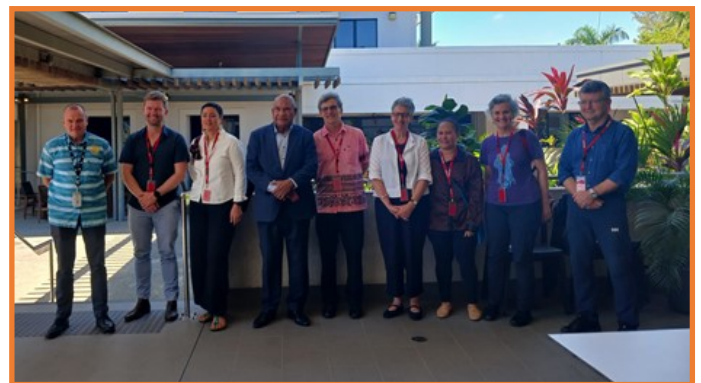
FemiliPNG Australia Board Members and Femili PNG Patron after their meeting with the Australian High Commissioner and his staff at the High Com office in POM in early August 2024.