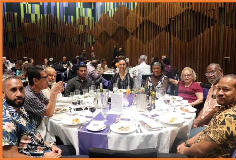
K92 Mining team during Femili PNG Gala Night on 3rd August 2024. K92 Mining was one of the Platinum Sponsor.