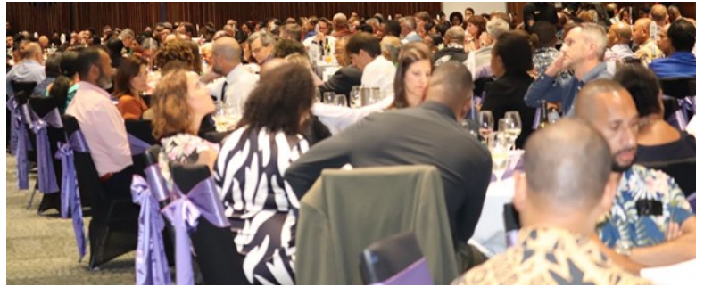
The sell-out crowd at the Gala Dinner. 03.08.2024