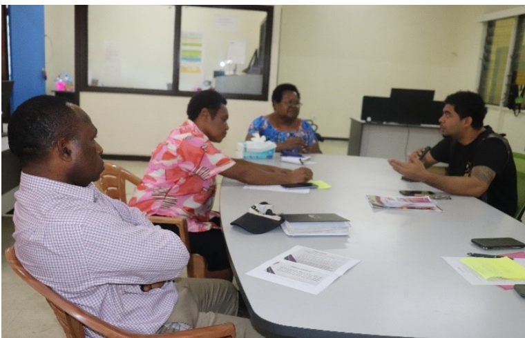
Femili PNG Training and Outreach team at NBC Radio Morobe.

Thank you NBC Morobe for allowing Femili PNG to reach out to wider audience. The team is anticipating that this information will help listeners to contact Femili PNG and to seek help.