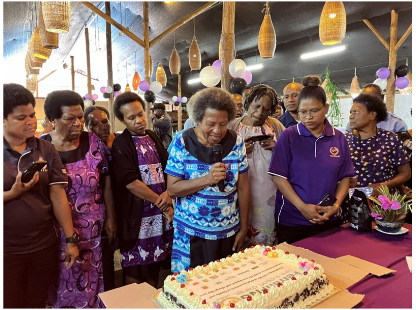
FPNG Goroka team and partners ready to cut tenth anniversary cake.