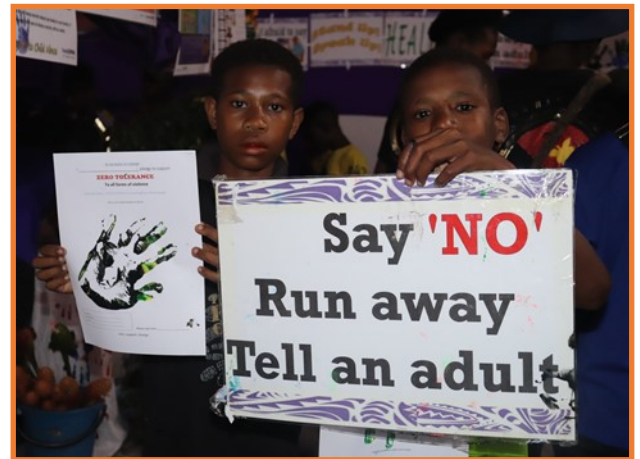
Kids participated with hand-painting activity and pledged against all forms of violence during Morobe Show—Colgate Health Expo.