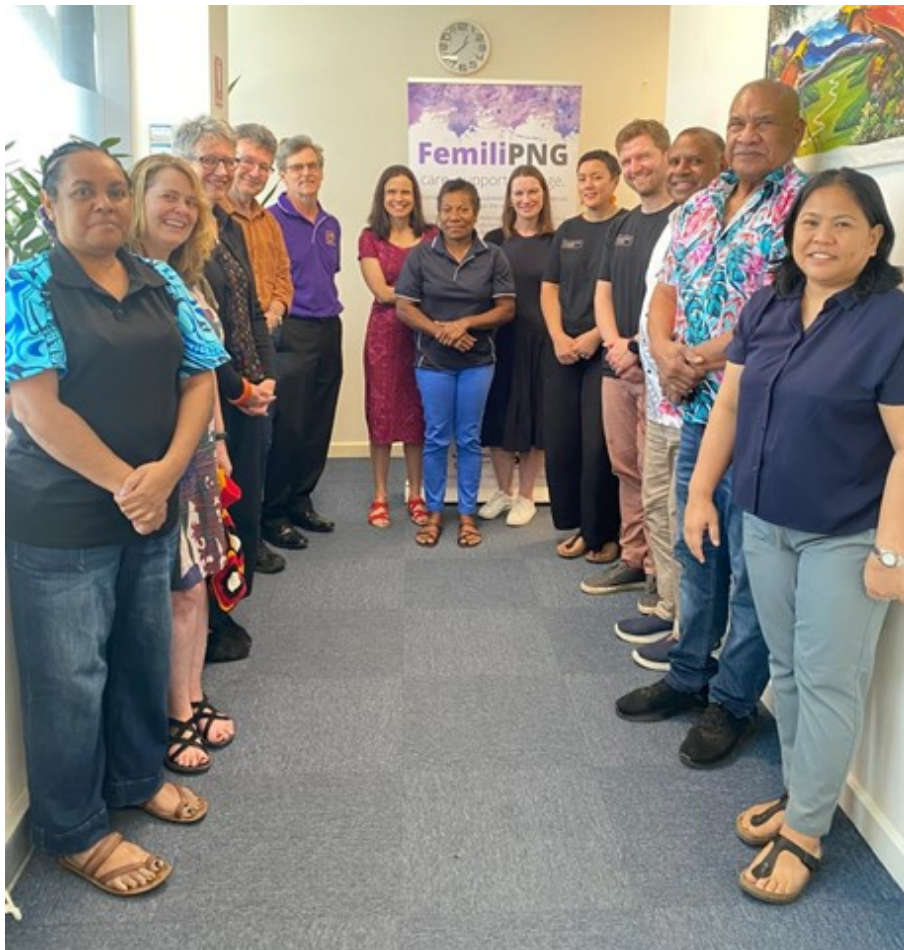
Photo: Femili PNG and FemiliPNG Australia Boards, with Femili PNG Patron.

Femili PNG would like to thank all the FemiliPNG Australia Board and staff members for joining in the celebrations, and for all the support they provided. In particular, FemiliPNG Australia organised and funded a fantastic 10-minute video on Femili PNG, which is available now on FPNG's website at https://femilpng.org/femili-png-film/ .