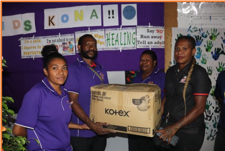
Sales officer from the Huggies Company in Lae donated some Kotex and baby diapers to FPNG clients during the recent 61st Morobe Show event in Lae.