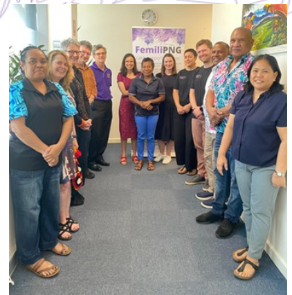
FPNG and FPNGA Boards ... page 4