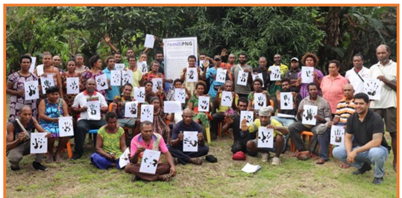
Photo: Group photo with community leaders and youths at Gabensis after information session with them on 7th July. They excitingly showed their pledged forms against all forms of violence.