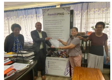
Femili PNG signs MOU ... page 9