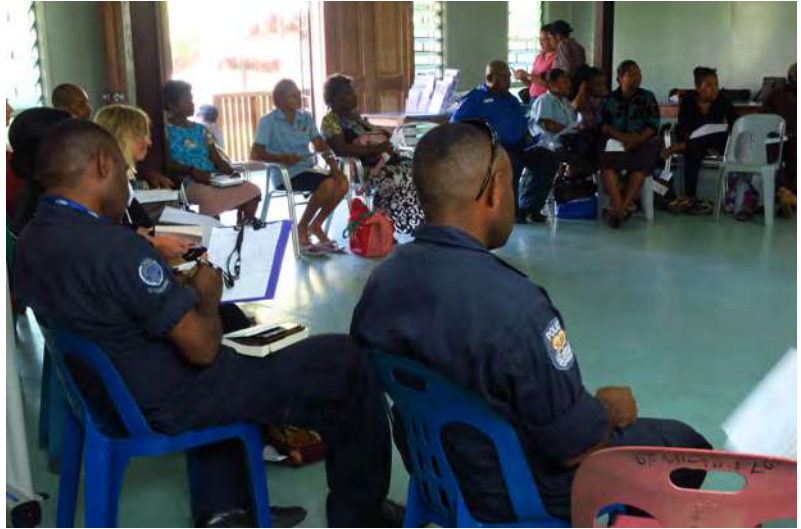
Lae police officers participate in stakeholder meeting with other FSV service providers

were referred by other sources, including 48 who were self-referred, and others from businesses, the NGO Yana Advocacy and the 1-Tok Kaunselin Helpim Lain (Childfund Hotline), and other provincial service providers.