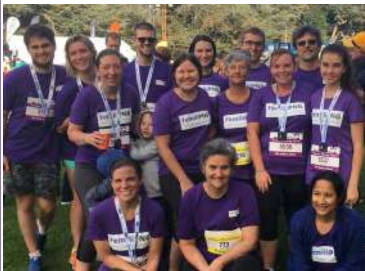
The team at the finish line of the 10km run

18 Canberrans participated in the Femili PNG team at the Canberra Running Festival this year and raised $21,785 for Femili PNG.